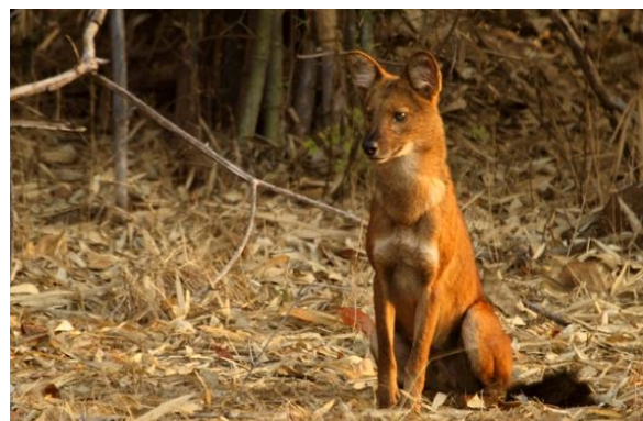
Clockwise from top-left: Marsh Mugger Crocodile, Black Eagle, Dhole and Leopard Gecko