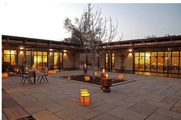
Bori Safari Lodge