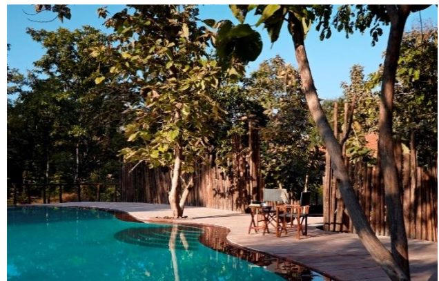
Reni Pani Jungle Lodge

naturalist and conservationist from the local royal family who both built and owns Reni Pani and has had a lifelong association with Satpura. Excursions will include jeep safaris into thenational park, walking safaris inside the park,