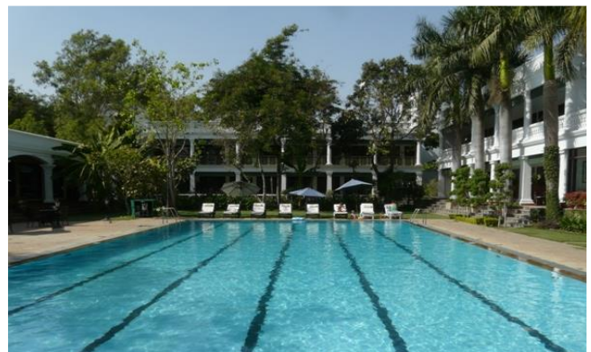
Jehan Numa Palace Hotel

We arrive in Delhi at 0115 hrs and connect on our own with the flight to Bhopal AI 435 at 05:55 hrs. We will arrive Bhopal at 07:25 hrs. We will meet our guide and enjoy the orientation tour of the city till our rooms are ready at the centrally located hotel, the 19th century Palace, Jehan Numa. It is nestled on the slopes of Shamla Hill, set in five acres of lush green lawns & splashes of colorful bougainvillea. It is a superb example of a medley of British Colonial, Italian