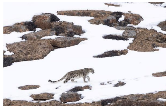
From Top: Leopard, Satpura National Park, Sloth Bears and Snow Leopard