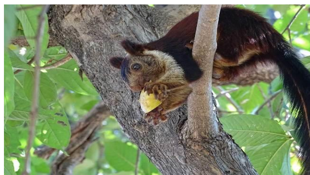
Indian Giant Squirrel