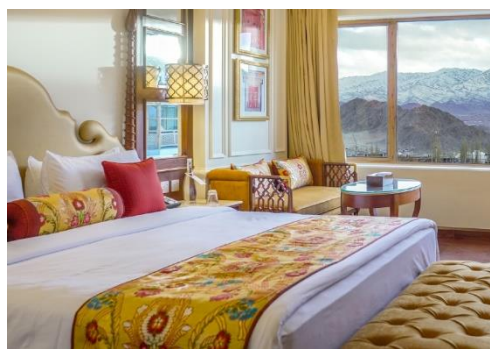
Grand Dragon Ladakh

In the evening, we will pay a visit to Shanti Stupa and local market in Leh.